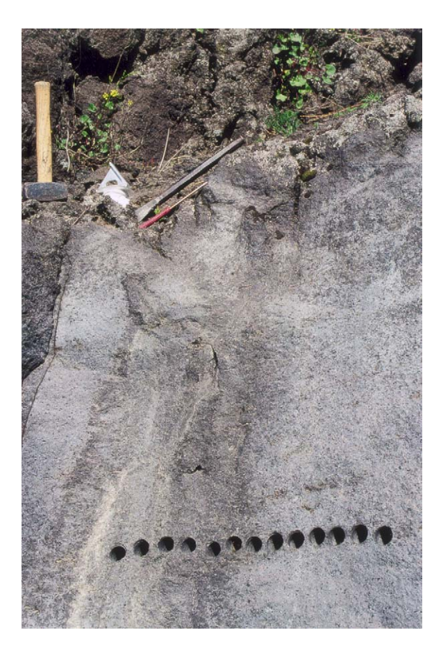
Fig. 3. Example of core-drilling "paleomagnetic" sampling of the 1646 flow from Mt. Etna. One of our plastered large samples can be seen aside the hammer at the upper left, the 18 others being distributed over the whole lava front (about 200 m).

tion. However, the resulting error on this procedure is small for Western Europe, on the order of 2^{\circ} (dispersions of declination and inclination are not comparable and depend upon local inclination as \cos(I) , and this is taken into account when calculating the uncertainty, see Bucur, 1994). Whatever the size of this approximation, we point out that: (1) Vesuvius and Etna may be considered as two sites only 350 km distant and (2) it is an evidence that our individual "volcanic" results draw the geomagnetic variation path practically on that of the French archeological curve when reduced to Southern Italy (except for the short period 1150–1300 where imprecise archeological data led to a Western deviation that is being corrected, see Tanguy et al., 2003, end of section 4-1 p. 120).